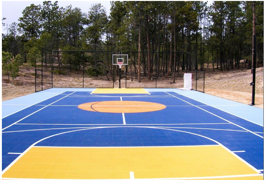
Images of Sport Court material and designs.